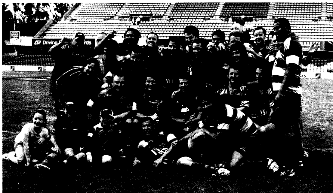
6th Grade Premiers 2007