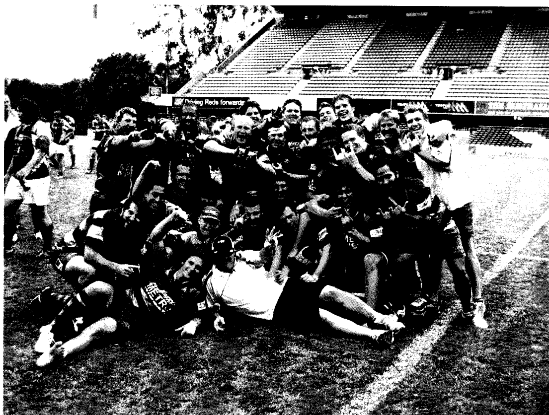
3rd Grade Premiers 2007