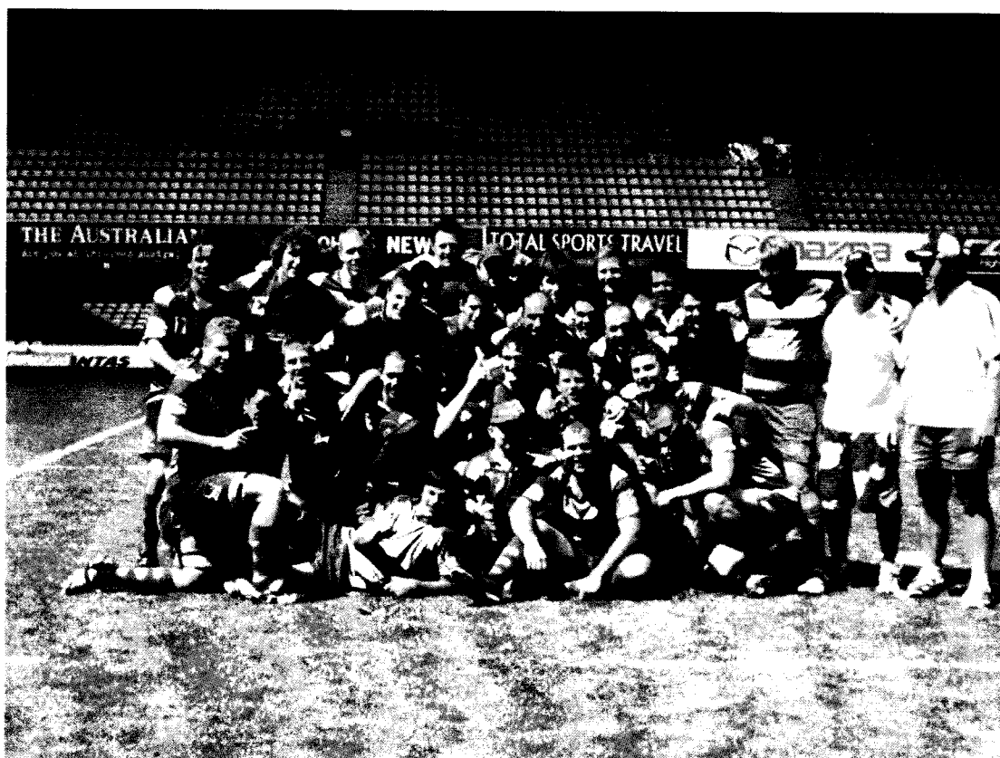
4th Grade Premiers 2007