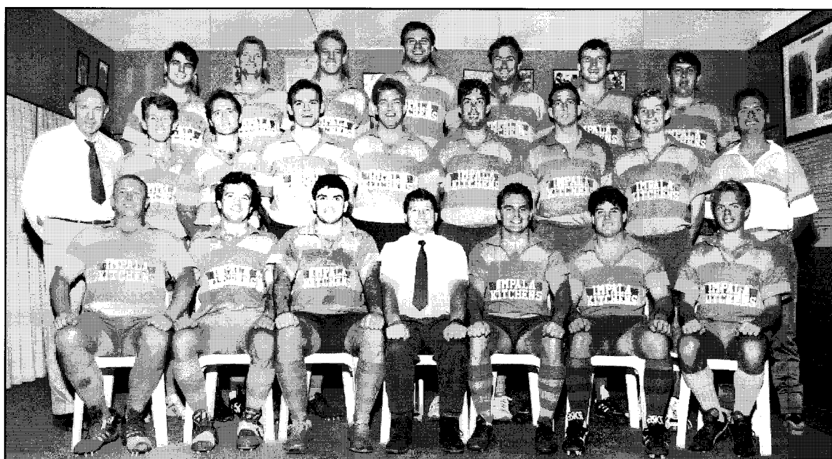
GPS RUGBY UNION 4TH GRADE - 1994