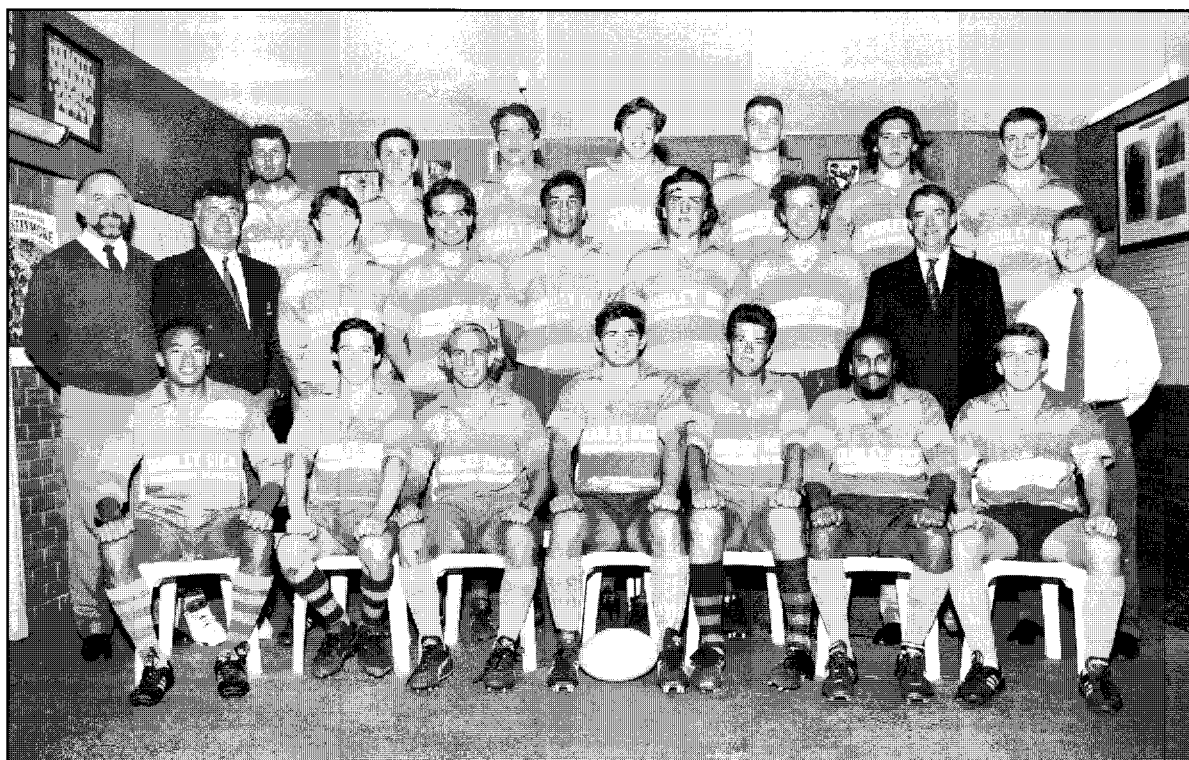
GPS RUGBY UNION COLTS 1 - 1994 MINOR PREMIERS - PREMIERS